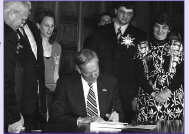
Governor Pataki signing Timothy's Law.

On December 22nd, following a week-long vigil outside the Governor's office on the 2nd floor of the Capitol, the Albany-based core members of the Timothy's Law Campaign, were invited into the "Red Room" -- a grand parlor adjacent the Governor's personal office -- to witness the signing of Timothy's Law. Already in place were a dozen or so TV news cameras, numerous newspaper photographers and a host of media reporters.